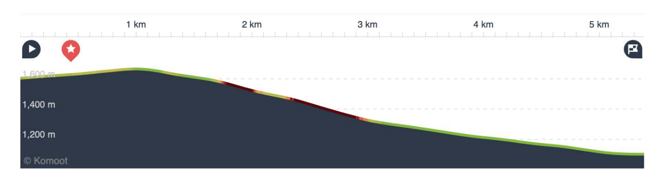
Day 2 - Mt. Asahidake to Mt. Kurodake Distance - 12.5 km / 7.8 miles Ascent - 1080 m / 3543 ft

Distance - 5.2 km / 3.2 miles Ascent - 70 m / 230 ft