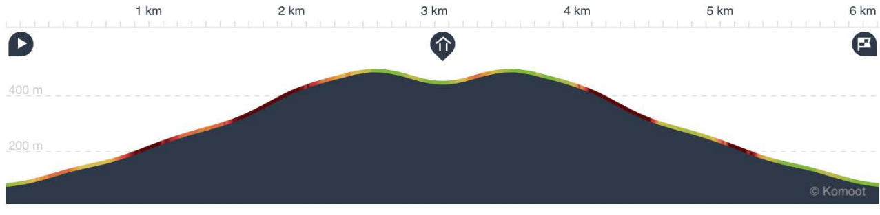
Page 15 of 16 Information correct as of 14 Nov 2024